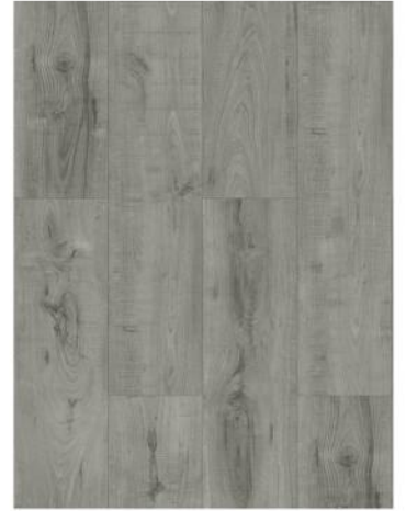
Soft Oak Grey