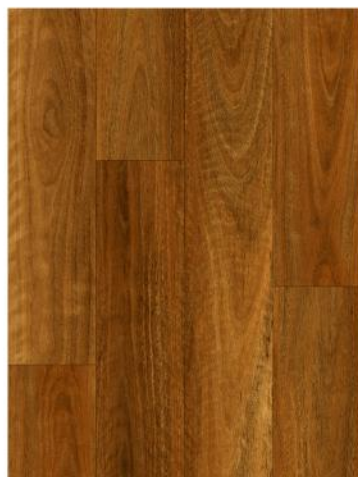
Native Spotted Gum