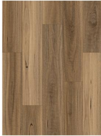
New England Spotted Gum