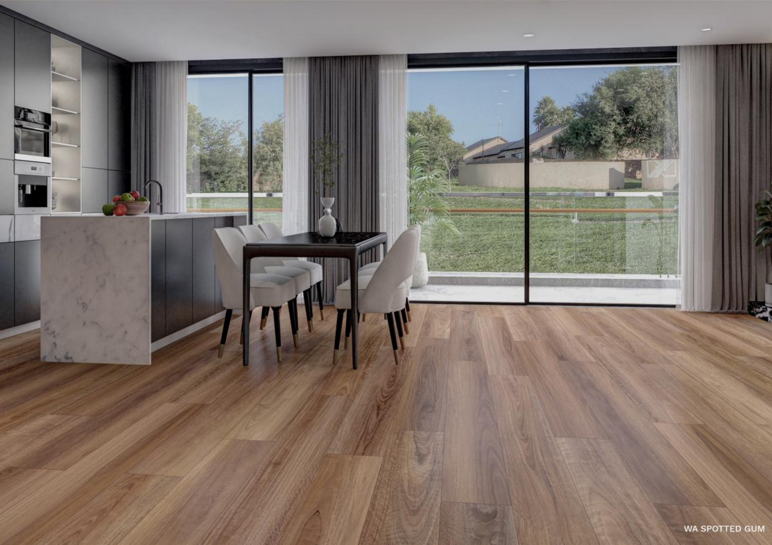
WA SPOTTED GUM