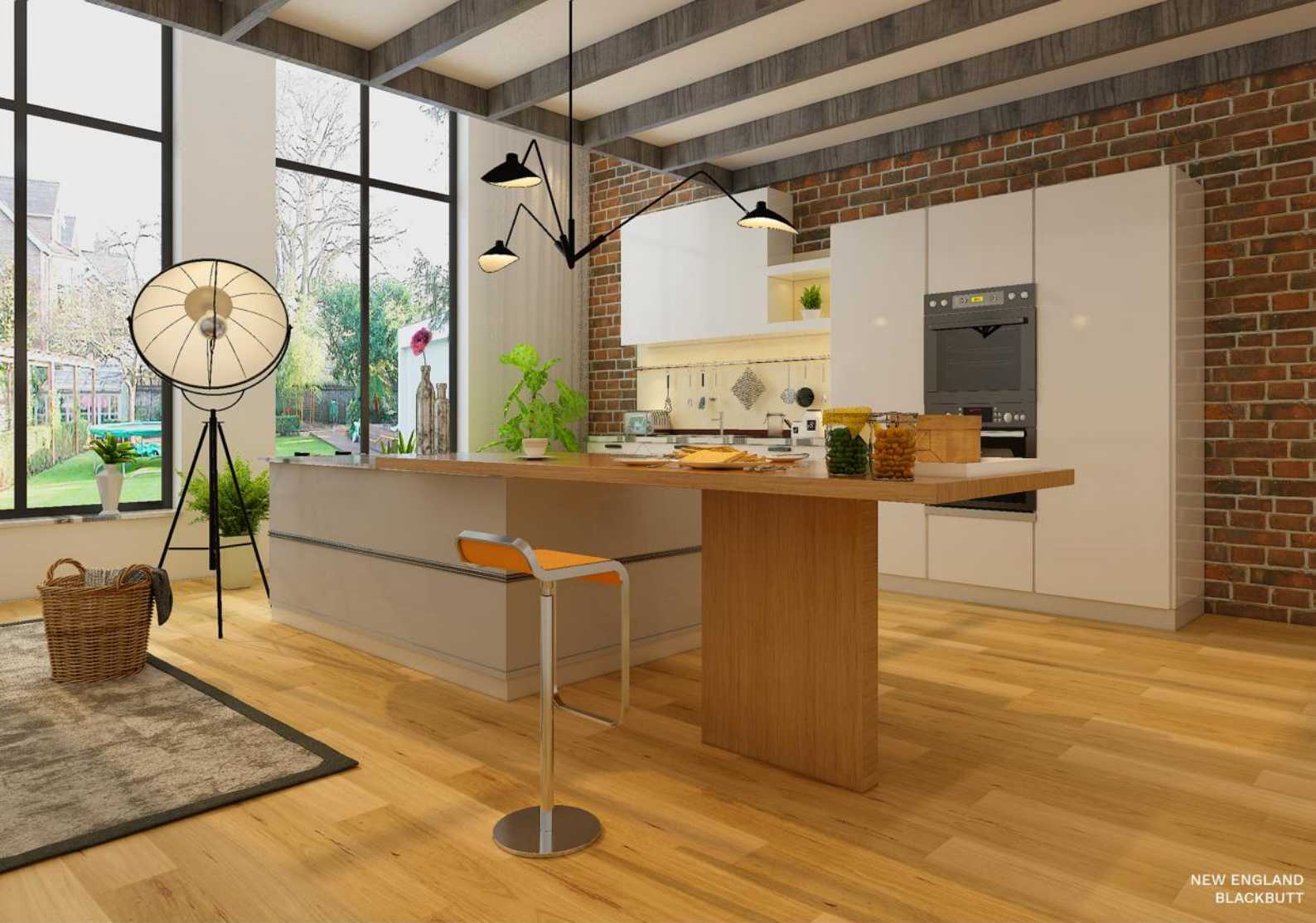
NEW ENGLAND BLACKBUTT