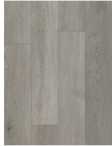
French Oak Grey