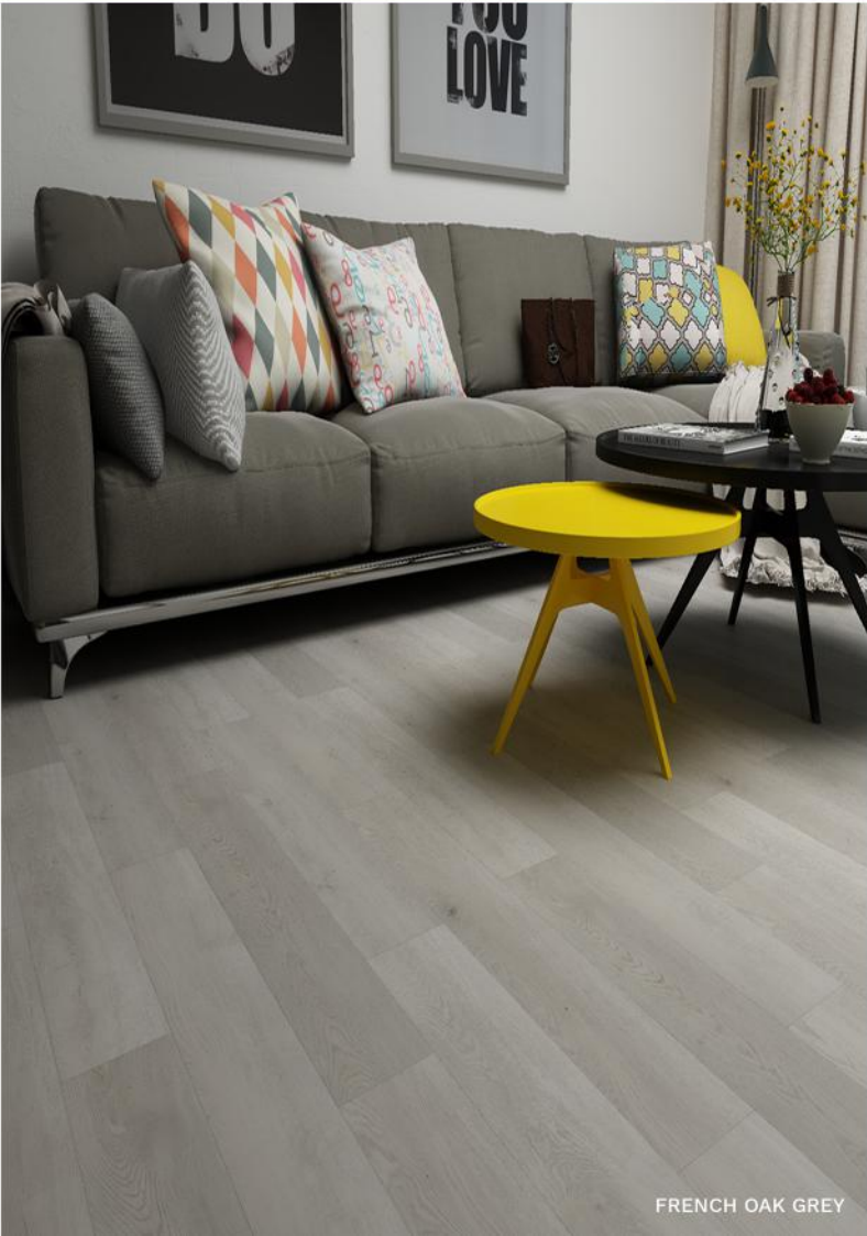
FRENCH OAK GREY