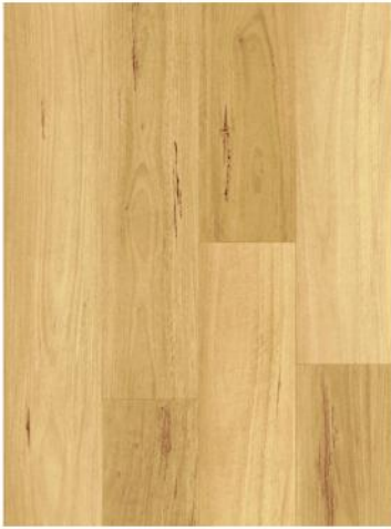
New England Blackbutt

The Rigid Ultra Range is strikingly beautiful thanks to the excellent balance between length and width. If you lay these solid, extended plank floors, you will generate a soft and tasteful effect. The planks are 100% waterproof and come in 4 stunning designs that are so true to nature thanks to a unique core technology.