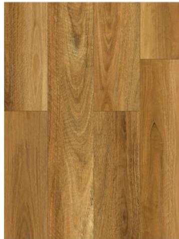
WA Spotted Gum