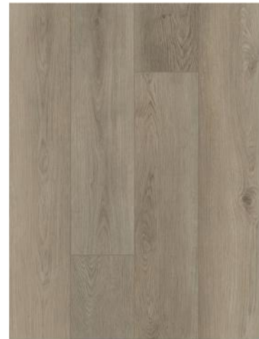
Soft Oak Natural