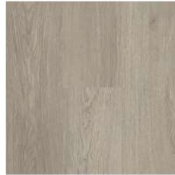
FRENCH OAK GREY