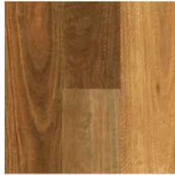
NEW ENGLAND SPOTTED GUM