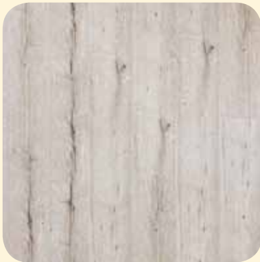
OLD OAK GREY BRUSHED CXF073