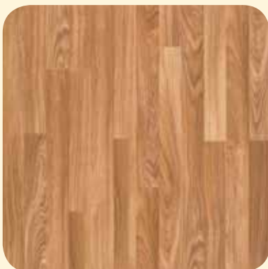
BRUSHBOX 2-STRIP CXF007